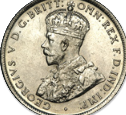
Choice Uncirculated Quite well struck, and only minor detail may be missing from the high points of the design. A scattering of fairly insignificant Detracting Marks may be present, but should not