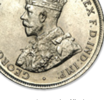
attract undue attention. Mint Lustre or Mint Bloom should be of at least moderate presence. A very pleasing coin with much Eye Appeal.